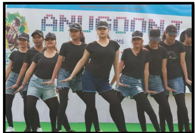
Street Dance Performance