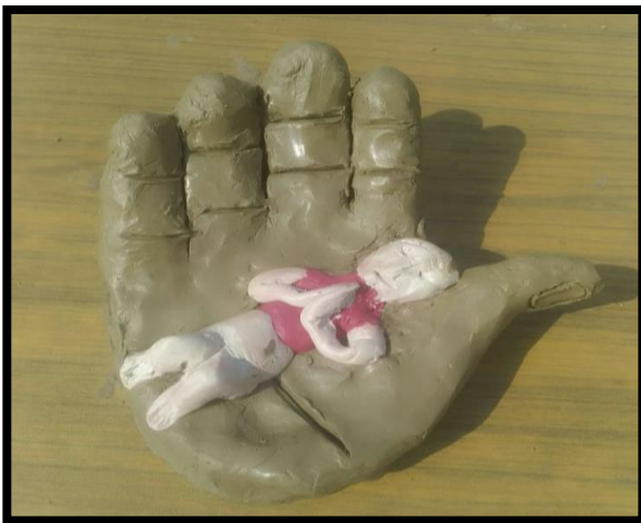
Clay Modeling on Save Girl Child