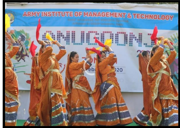
Folk Dance Performance