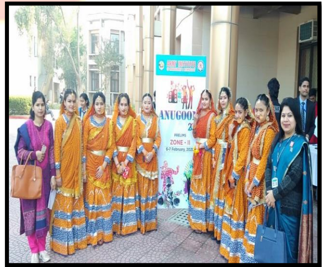
Accompany Faculties with Participants