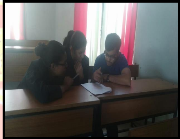
Quiz Team of AIE