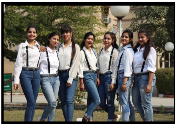
Foot Loose Performance