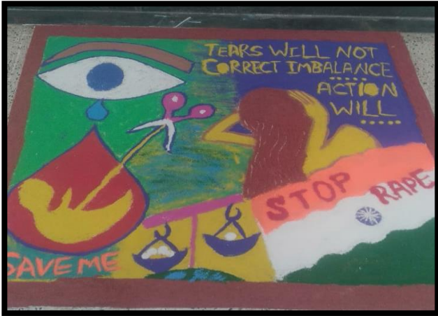
Rangoli Made by AIE Student