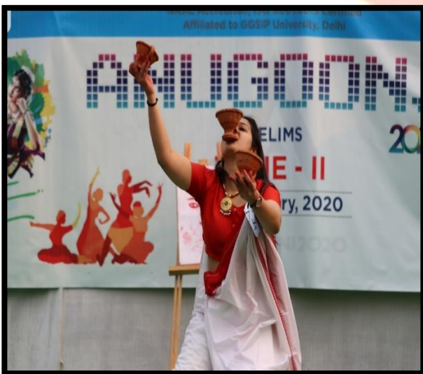
Miss Anugoonj Talent Round Performance